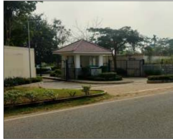
Our completed Project Serene Hills, 16+ Acres BMRDA approved layout with RERA no at Gulakamale, Off Kanakapura Road Bangalore South